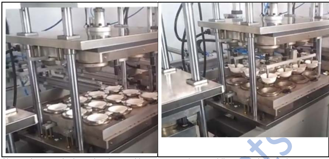
Above photograph shows bowls cured in a compression moulding press being taken out

One can also produce foamed starch products i.e. with tiny pockets of gas which reduces the product density thus reducing weight and material cost. For this one can use a foaming agent like sodium bicarbonate to produce gas which is entrapped in the material and makes tiny gas pockets.