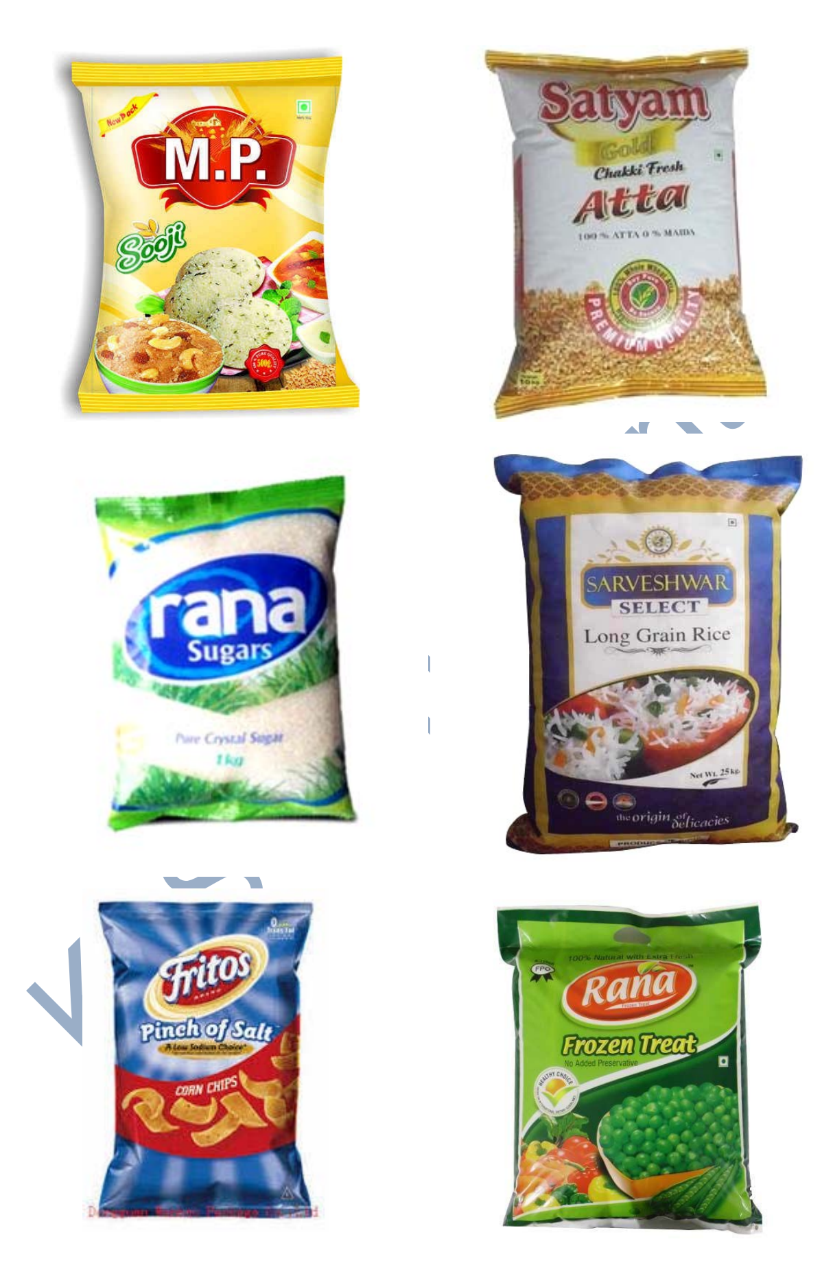
Disclaimer: All images are for representation purpose only